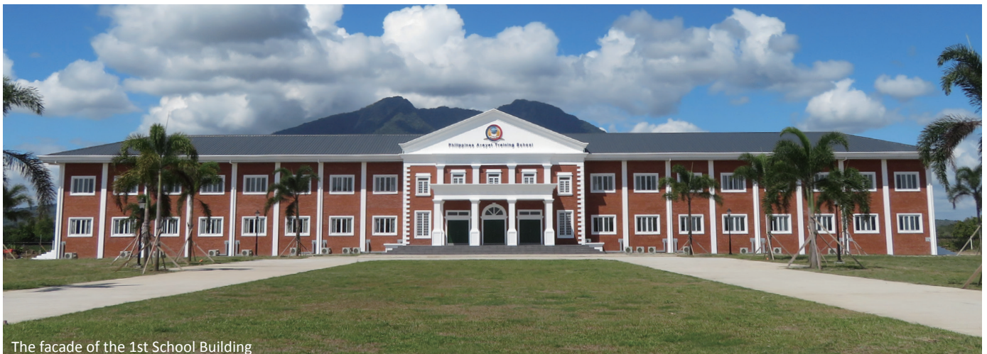
The facade of the 1st School Building